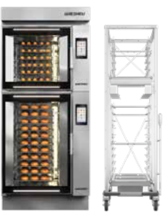
E3 SL with loading system